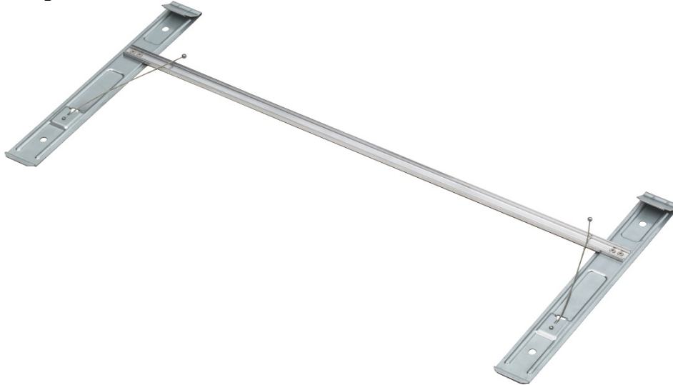
Image 2. 2x2 CFMK Bracket