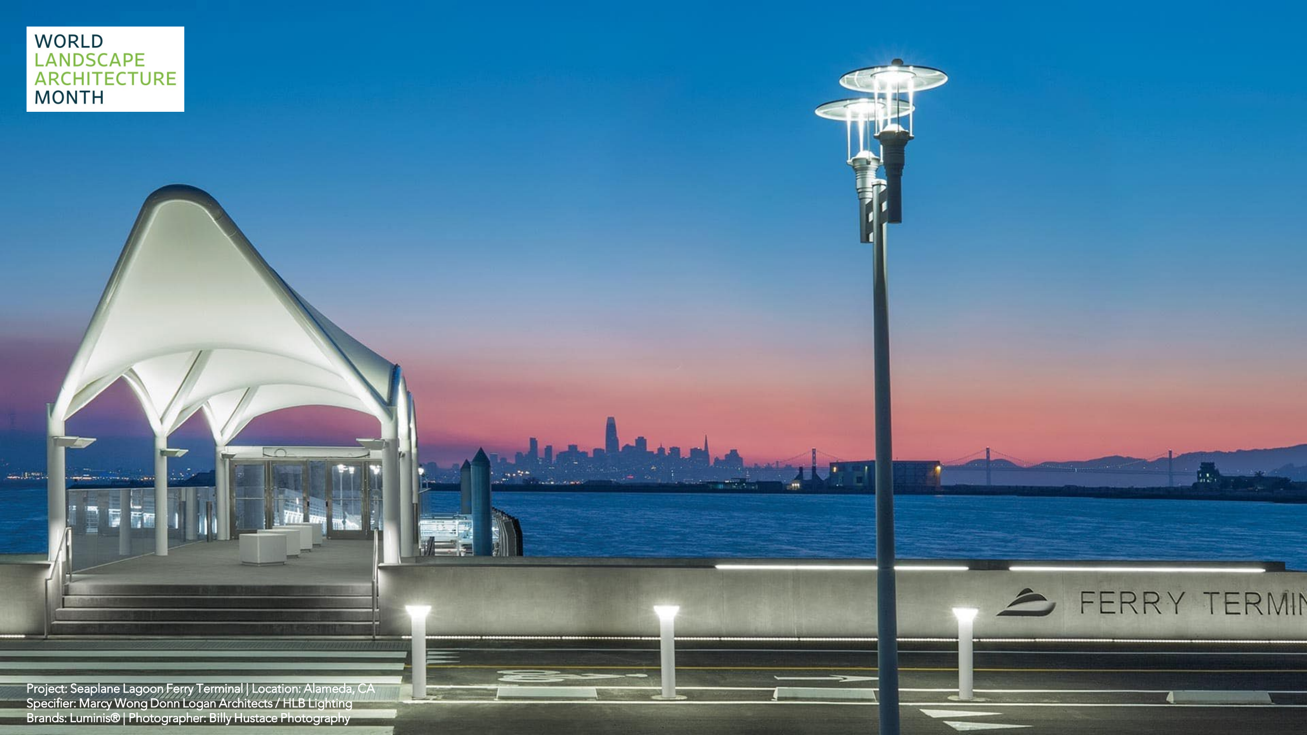
Project: Seaplane Lagoon Ferry Terminal | Location: Alameda, CA Specifier: Marcy Wong Donn Logan Architects / HLB Lighting Brands: Luminis® | Photographer: Billy Hustace Photography