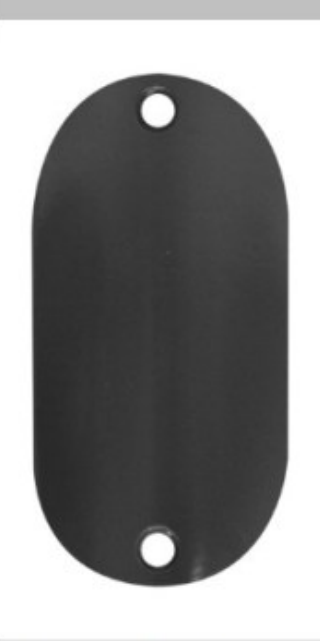
HHC for LEX TYPE LR2 <color> 2 \frac{1}{2} " x 5 \frac{1}{4} " Hole to hole 4 \frac{1}{2} "