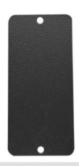
HHC for HAP TYPE HS2 <color> 2 \frac{1}{2} " x 5 \frac{1}{2} ", 5/16" Holes set on 5" centers