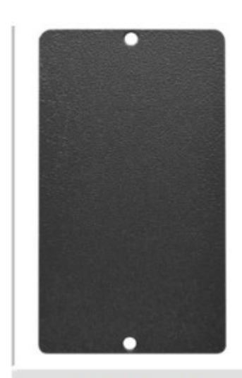
HHC for HAP TYPE HS1 <color> 6 1/2" x 3 1/2" Hole 6" Apart